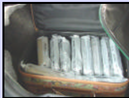
27 Bricks of Cocaine 3

In other border activity, on May 27, 2003, two suspects from Canada entered the U.S. at the Blaine border crossing and traveled to Bellingham where they made a rendezvous with a lead target. Approximately 27 bricks of cocaine weighing 29.8 kilograms (photo 3) were transferred from a suspect residing in the U.S. to a vehicle operated by the Canadians. The suspects were subsequently apprehended prior to crossing the border back into Canada with the cocaine. On May 29, 2003, suspects residing in Bellingham hiked across the U.S./Canadian border on a trail on the east of the Cascade Mountain range with 70 lbs. of marijuana in an attempt to evade more intense border security on the west side of the