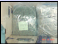
107 Bags of Marijuana 2

ada and destined for Los Angeles revealed that the pallets were stacked to allow a hollow center in the trailer. (photo 1) There were 107 clear plastic vacuum-sealed bags of marijuana weighing 1,306 lbs. with an estimated street value of 4-7 million dollars discovered (photo 2).