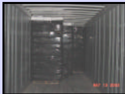
Baled Wood Shavings 1

In Feb 2003, an Integrated Border Enforcement Team (IBET) effort led to three arrests and the recovery of diamonds, about $100,000 in cash and 41 handguns when the suspects were tracked through almost 2 miles of swamps, brush and backyards as they were en route to Canada. On April 26, 2003, BICE Marine Enforcement Officers intercepted 320 lbs. of BC Bud on board a 27-foot cruiser in U.S. waters near the San Juan Islands. On May 13, an inspection of a truck full of baled wood shavings coming from Can-